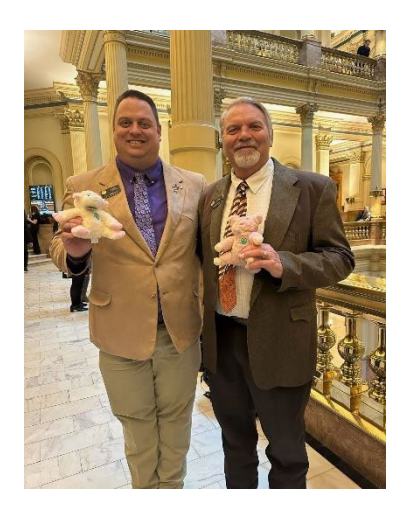
Senators Byron Pelton and Rod Pelton, during 4-H Day at the Capitol

On Wednesday, January 10, the 2024 Colorado Legislative Session began. I am privileged and proud to be serving another year as your State Senator.